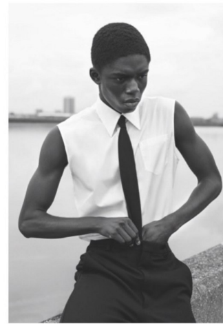
shirt, trousers and tie Prada Right page coat, shirt and tie Prada